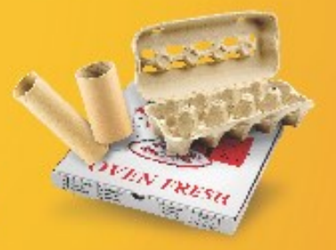
CARDBOARDS any size, any kind