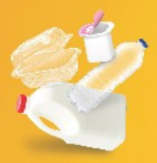
PLASTICS with numbers 1-7 on bottom