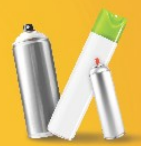
AEROSOLS empty hairspray, cleaning supplies and shaving cream