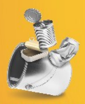
CLEAN & EMPTY CANS food, beverage, paint, soup and pet food