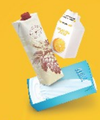
CARTONS milk, juice and broth cartons